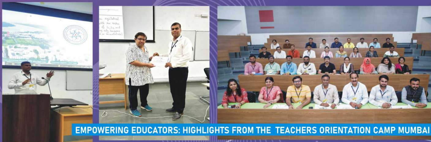
EMPOWERING EDUCATORS: HIGHLIGHTS FROM THE TEACHERS ORIENTATION CAMP MUMBAI